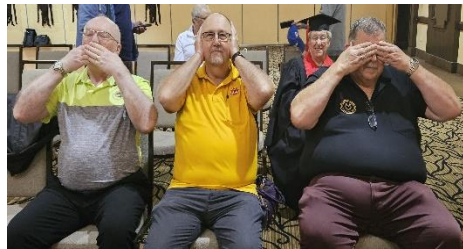
Three Monkeys came to the Golden Gavel Ceremony